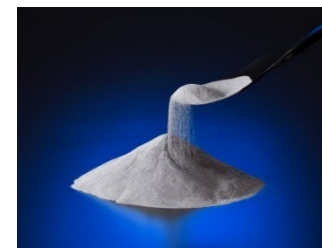
Metal additive manufacturing material ADMUSTER®

Since chemical plants and semiconductor manufacturing plants use highly corrosive fluid, the corrosion resistance of the parts used for the equipment is important. Using parts with higher corrosion resistance makes it possible to improve reliability, resulting in reduced operation halt risk and lower frequency of part exchange. Furthermore, additive manufacturing eliminates die preparation and assembly processes and shortens the lead time for small lot production. Since these characteristics not only enable lower costs but also lead to the reduction of CO 2 generated in the part production processes, customer expectations are rising, and customers have already started mass production of metal additive manufacturing parts made of ADMUSTER® C21P.